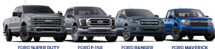
FORD SUPER DUTY FORD F-150 FORD RANGER FORD MAVERICK

*Visit FordRecognizesU.com/FarmBureau today for complete offer details!